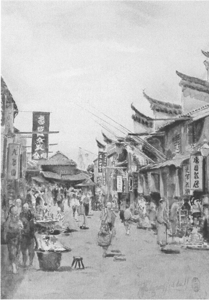
Figure 1. (Colour online) The native city of Shanghai in 1907 painted by Thomas Hodgson Liddell.

transcend boundaries and become a site to manifest modernity's ambivalence.