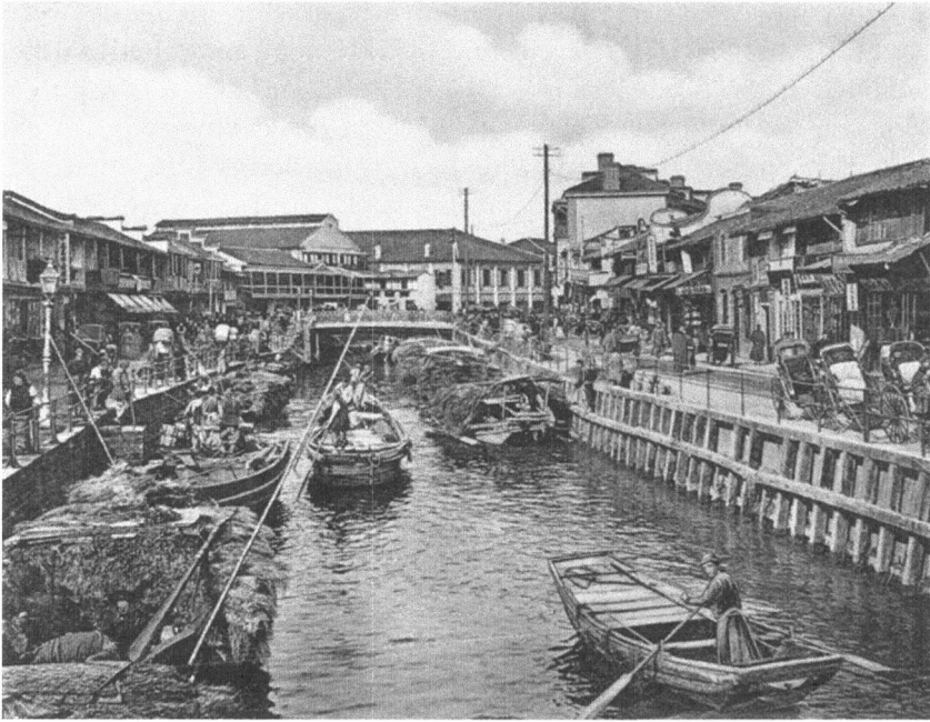
Figure 3. (Colour online) Yangking Creek (Yangjing bang) circa 1907.

serving the Council. Dr Galle suggested in his report demolishing the dam between the Yangking Creek (see Figure 3) and Defense Creek because the waste from slaughter-houses nearby accumulated there, emanating fetid smells, which were injurious to public health. Once the dam was removed, the flow of water would prevent the accumulation of waste and thus diminish the stench. 63 In addition to the removal of stinking water, constructing a modern sewage and drainage system was vital to the maintenance of a deodorizing environment.